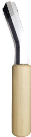
3/4" Hand Scraper